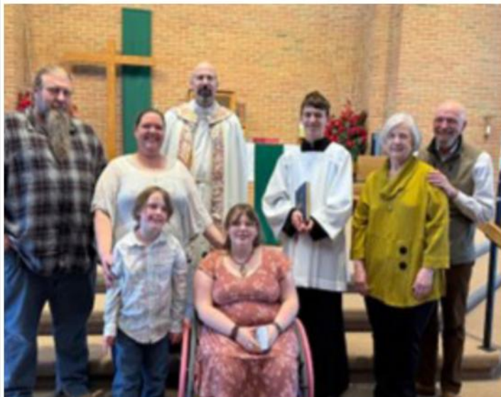
St. Anthony of Padua, Pray for us!